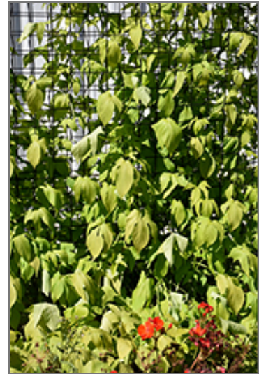
SolarTower Lime Sweet Potato Vine foliage

SolarTower Lime Sweet Potato Vine is a fine choice for the garden, but it is also a good selection for planting in outdoor containers and hanging baskets. With its upright habit of growth, it is best suited for use as a 'thriller' in the 'spiller-thriller-filler' container combination; plant it near the center of the pot, surrounded by smaller plants and those that spill over the edges. It is even sizeable enough that it can be grown alone in a suitable container. Note that when growing plants in outdoor containers and baskets, they may require more frequent waterings than they would in the yard or garden.