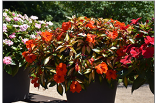
SunPatiens Vigorous Tropical Orange New Guinea Impatiens in bloom

SunPatiens Vigorous Tropical Orange New Guinea Impatiens is a fine choice for the garden, but it is also a good selection for planting in outdoor containers and hanging baskets. Because of its height, it is often used as a 'thriller' in the 'spiller-thriller-filler' container combination; plant it near the center of the pot, surrounded by smaller plants and those that spill over the edges. It is even sizeable enough that it can be grown alone in a suitable container. Note that when growing plants in outdoor containers and baskets, they may require more frequent waterings than they would in the yard or garden.