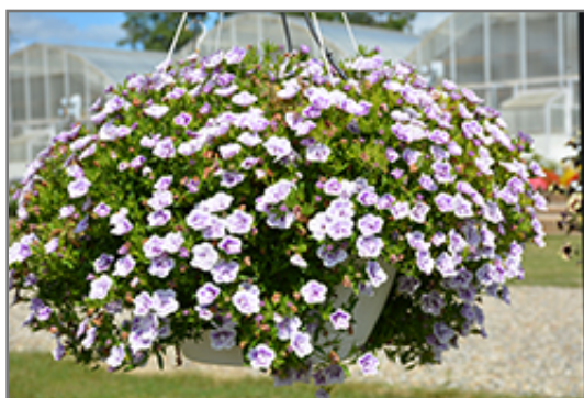
MiniFamous Uno Double PlumTastic Calibrachoa in bloom