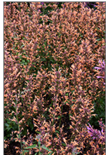
Sunrise Orange Hyssop flowers