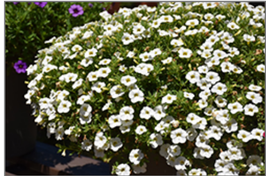
Cabaret Bright White Calibrachoa flowers

Cabaret Bright White Calibrachoa is recommended for the following landscape applications;