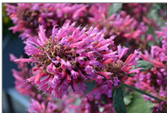
Morello Hyssop flowers