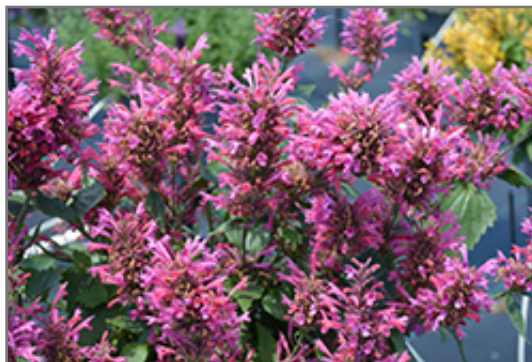
Morello Hyssop flowers

Morello Hyssop is recommended for the following landscape applications;