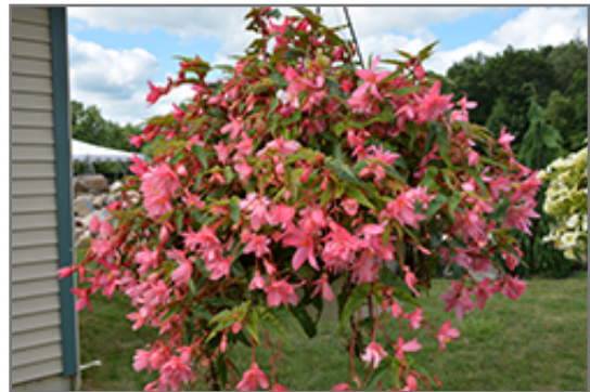
Funky Light Pink Begonia in bloom