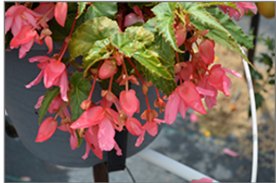
Funky Light Pink Begonia flowers

Funky Light Pink Begonia is a fine choice for the garden, but it is also a good selection for planting in outdoor containers and hanging baskets. It is often used as a 'filler' in the 'spiller-thriller-filler' container combination, providing a mass of flowers and foliage against which the thriller plants stand out. Note that when growing plants in outdoor containers and baskets, they may require more frequent waterings than they would in the yard or garden.