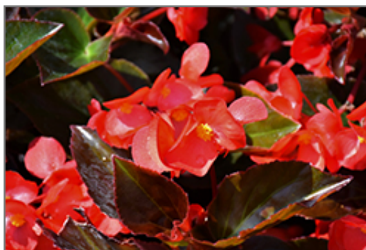
Big DeLuXXE Red Bronze Leaf Begonia flowers