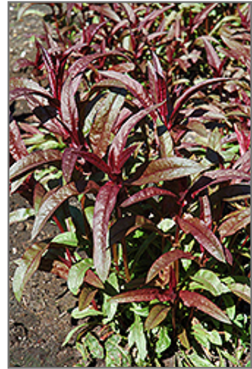
Firecracker Loosestrife foliage

Firecracker Loosestrife is a fine choice for the garden, but it is also a good selection for planting in outdoor pots and containers. With its upright habit of growth, it is best suited for use as a 'thriller' in the 'spiller-thriller-filler' container combination; plant it near the center of the pot, surrounded by smaller plants and those that spill over the edges. It is even sizeable enough that it can be grown alone in a suitable container. Note that when growing plants in outdoor containers and baskets, they may require more frequent waterings than they would in the yard or garden. Be aware that in our climate, most plants cannot be expected to survive the winter if left in containers outdoors, and this plant is no exception. Contact our experts for more information on how to protect it over the winter months.