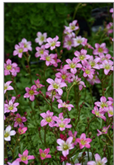
Touran Pink Saxifrage flowers