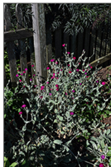
Rose Campion in bloom