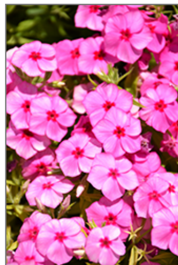
Gisele Pink Phlox flowers