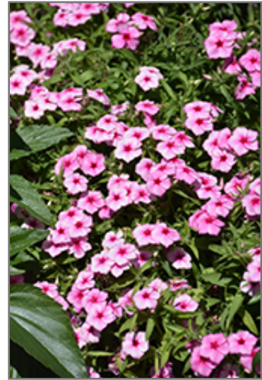
Gisele Pink Phlox flowers

Gisele Pink Phlox is a fine choice for the garden, but it is also a good selection for planting in outdoor containers and hanging baskets. It is often used as a 'filler' in the 'spiller-thriller-filler' container combination, providing a mass of flowers against which the thriller plants stand out. Note that when growing plants in outdoor containers and baskets, they may require more frequent waterings than they would in the yard or garden.