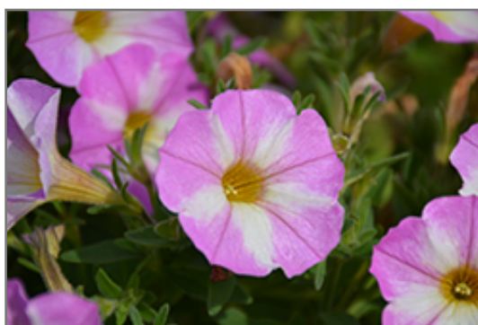
SuperCal Lavender Star Petchoa flowers