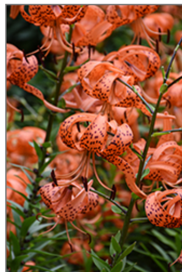
Tiger Lily flowers