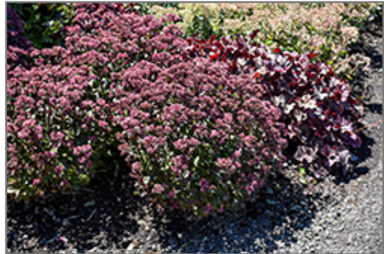
Double Martini Stonecrop in bloom

This plant is not reliably hardy in our region, and certain restrictions may apply; contact the store for more information.