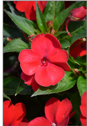
SunPatiens Vigorous Red Impatiens flowers

SunPatiens Vigorous Red Impatiens is a fine choice for the garden, but it is also a good selection for planting in outdoor containers and hanging baskets. Because of its height, it is often used as a 'thriller' in the 'spiller-thriller-filler' container combination; plant it near the center of the pot, surrounded by smaller plants and those that spill over the edges. It is even sizeable enough that it can be grown alone in a suitable container. Note that when growing plants in outdoor containers and baskets, they may require more frequent waterings than they would in the yard or garden.