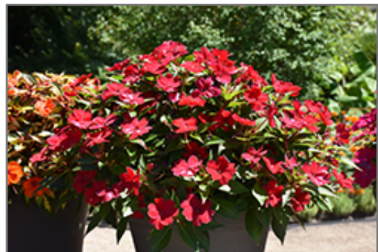
SunPatiens Vigorous Red Impatiens in bloom