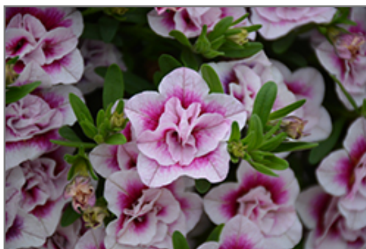
MiniFamous Uno Double PinkTastic Calibrachoa flowers

This plant will require occasional maintenance and upkeep. Trim off the flower heads after they fade and die to encourage more blooms late into the season. It is a good choice for attracting bees and butterflies to your yard, but is not particularly attractive to deer who tend to leave it alone in favor of tastier treats. It has no significant negative characteristics.