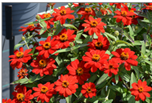
Profusion Red Zinnia in bloom

Profusion Red Zinnia is recommended for the following landscape applications;