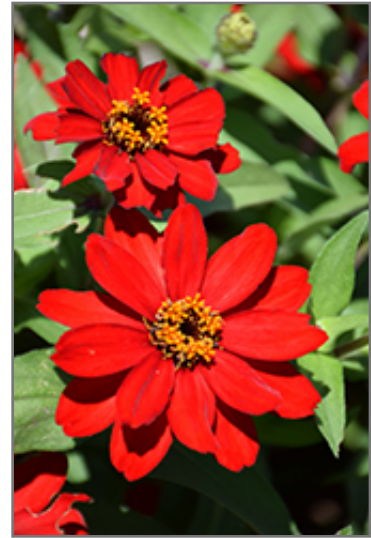
Profusion Red Zinnia flowers

Profusion Red Zinnia is a fine choice for the garden, but it is also a good selection for planting in outdoor containers and hanging baskets. It is often used as a 'filler' in the 'spiller-thriller-filler' container combination, providing a mass of flowers against which the thriller plants stand out. Note that when growing plants in outdoor containers and baskets, they may require more frequent waterings than they would in the yard or garden.