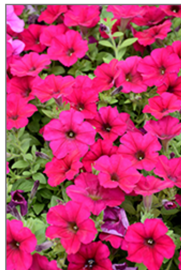
Wave Carmine Velour Petunia flowers

Wave Carmine Velour Petunia is recommended for the following landscape applications;