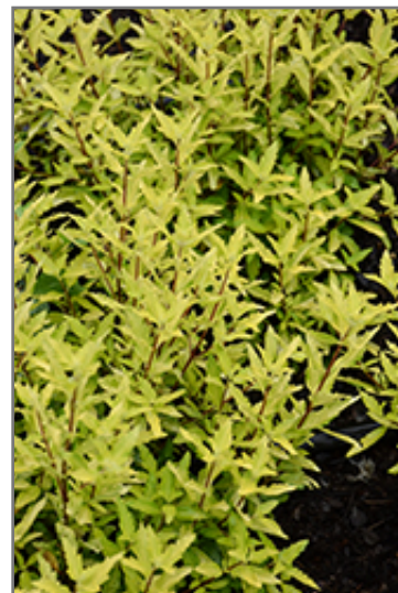
Gold Crest Caryopteris foliage

Gold Crest Caryopteris is recommended for the following landscape applications;