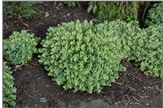
Powderpuff Stonecrop

Powderpuff Stonecrop will grow to be about 8 inches tall at maturity, with a spread of 18 inches. When grown in masses or used as a bedding plant, individual plants should be spaced approximately 16 inches apart. Its foliage tends to remain low and dense right to the ground. It grows at a fast rate, and under ideal conditions can be expected to live for approximately 15 years. As an herbaceous perennial, this plant will usually die back to the crown each winter, and will regrow from the base each spring. Be careful not to disturb the crown in late winter when it may not be readily seen!