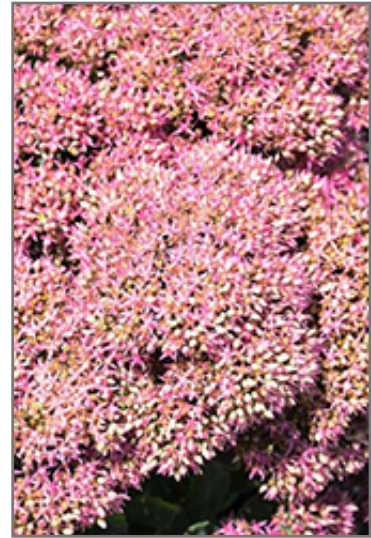
Powderpuff Stonecrop flowers

Powderpuff Stonecrop is recommended for the following landscape applications;