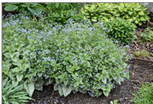
Queen of Hearts Bugloss in bloom

Queen of Hearts Bugloss is recommended for the following landscape applications;