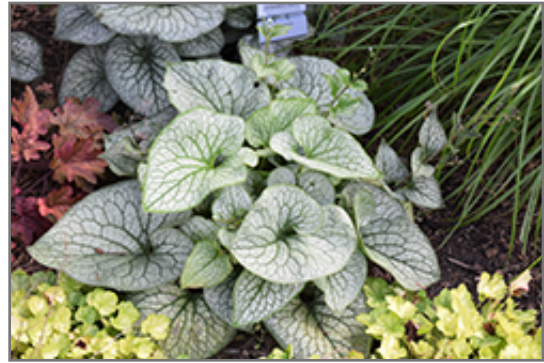
Queen of Hearts Bugloss foliage

Queen of Hearts Bugloss will grow to be about 18 inches tall at maturity extending to 30 inches tall with the flowers, with a spread of 3 feet. When grown in masses or used as a bedding plant, individual plants should be spaced approximately 30 inches apart. It grows at a medium rate, and under ideal conditions can be expected to live for approximately 10 years. As an herbaceous perennial, this plant will usually die back to the crown each winter, and will regrow from the base each spring. Be careful not to disturb the crown in late winter when it may not be readily seen!