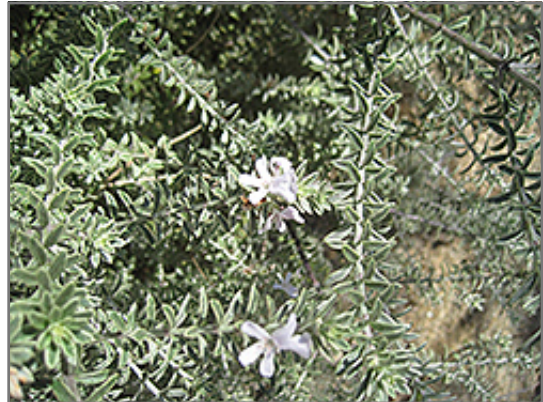
Morning Light Coast Rosemary flowers

This plant is not reliably hardy in our region, and certain restrictions may apply; contact the store for more information.