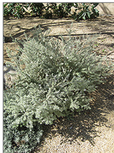
Morning Light Coast Rosemary