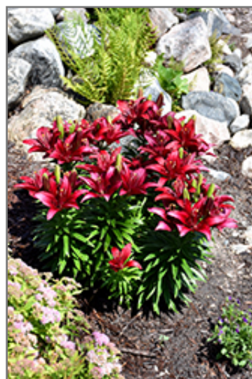
Lily Looks Tiny Rocket Lily in bloom