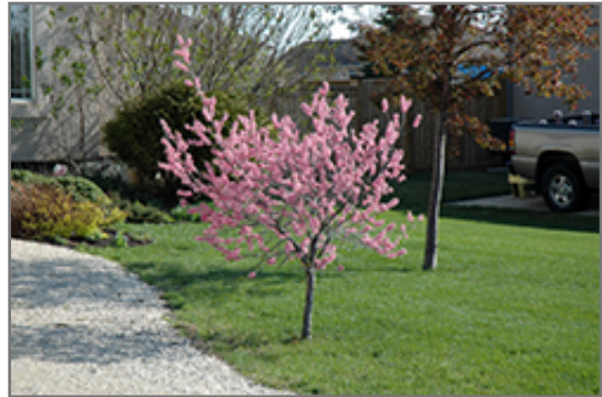
Muckle Plum in bloom

This shrub should only be grown in full sunlight. It does best in average to evenly moist conditions, but will not tolerate standing water. It is not particular as to soil type or pH. It is highly tolerant of urban pollution and will even thrive in inner city environments. This particular variety is an interspecific hybrid.