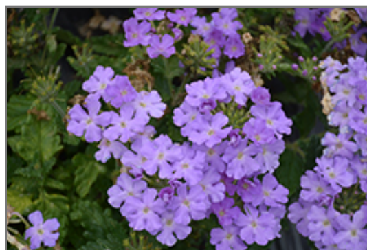
Firehouse Lavender Verbena flowers