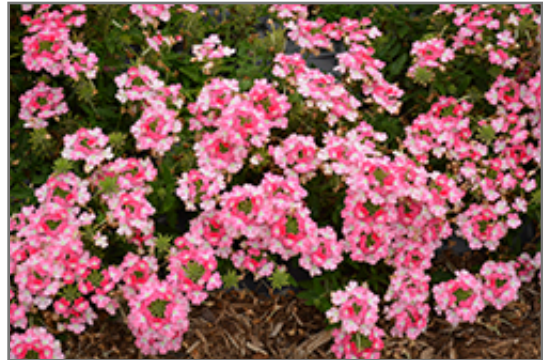
EnduraScape Pink Fizz Verbena flowers

EnduraScape Pink Fizz Verbena is a fine choice for the garden, but it is also a good selection for planting in outdoor containers and hanging baskets. Because of its trailing habit of growth, it is ideally suited for use as a 'spiller' in the 'spiller-thriller-filler' container combination; plant it near the edges where it can spill gracefully over the pot. Note that when growing plants in outdoor containers and baskets, they may require more frequent waterings than they would in the yard or garden.