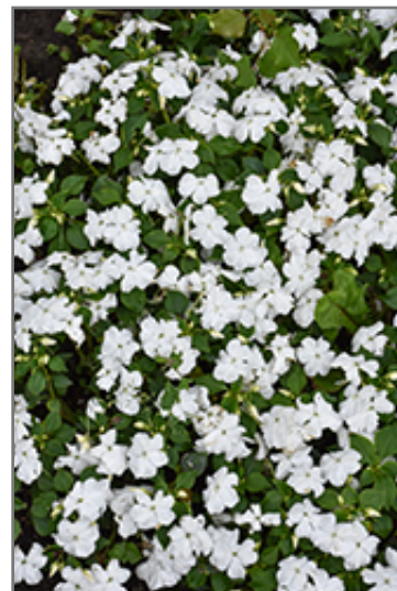
Beacon White Impatiens flowers

Beacon White Impatiens is recommended for the following landscape applications;