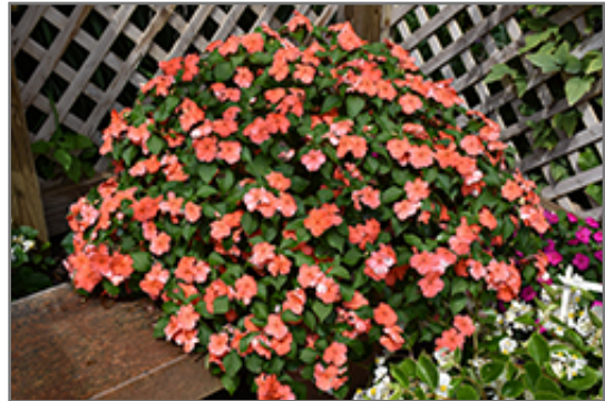
Beacon Salmon Impatiens in bloom

Beacon Salmon Impatiens is recommended for the following landscape applications;