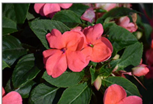
Beacon Coral Impatiens flowers