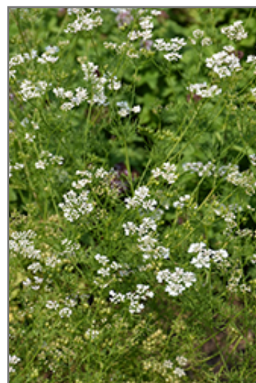
Santo Cilantro flowers