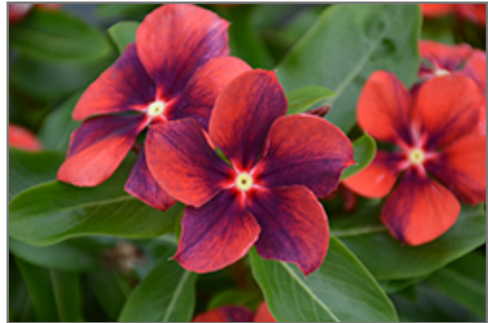
Tattoo Tangerine Vinca flowers

This plant will require occasional maintenance and upkeep, and should not require much pruning, except when necessary, such as to remove dieback. It is a good choice for attracting butterflies to your yard, but is not particularly attractive to deer who tend to leave it alone in favor of tastier treats. It has no significant negative characteristics.