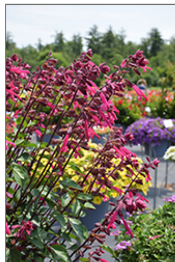
Skyscraper Dark Purple Salvia flowers

Skyscraper Dark Purple Salvia is an herbaceous annual with an upright spreading habit of growth. Its relatively fine texture sets it apart from other garden plants with less refined foliage.