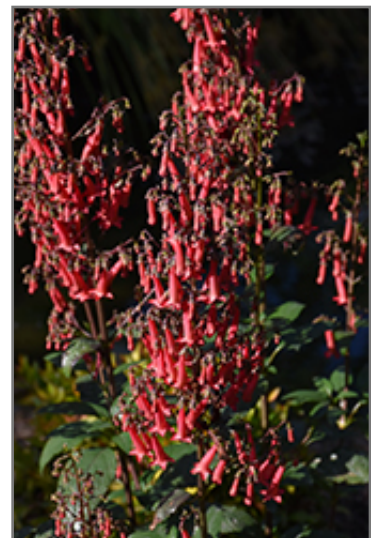
COLORBURST Deep Red Cape Fuchsia flowers