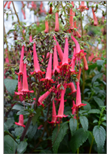
COLORBURST Deep Red Cape Fuchsia flowers