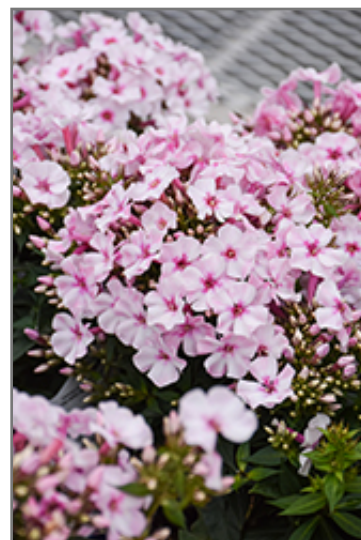
Early Pink Dark Eye Garden Phlox flowers

Early Pink Dark Eye Garden Phlox is recommended for the following landscape applications;