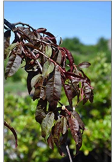
Crimson Cascade Weeping Peach foliage

This plant is not reliably hardy in our region, and certain restrictions may apply; contact the store for more information.