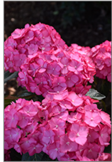
Seaside Serenade Hamptons Hydrangea flowers

This plant is not reliably hardy in our region, and certain restrictions may apply; contact the store for more information.