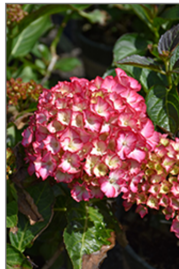
Seaside Serenade Hamptons Hydrangea flowers