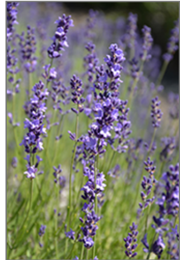
Provence Blue Lavender flowers

This is a relatively low maintenance plant, and can be pruned at anytime. It is a good choice for attracting bees and butterflies to your yard, but is not particularly attractive to deer who tend to leave it alone in favor of tastier treats. It has no significant negative characteristics.