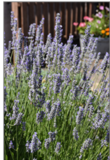
Provence Blue Lavender flowers