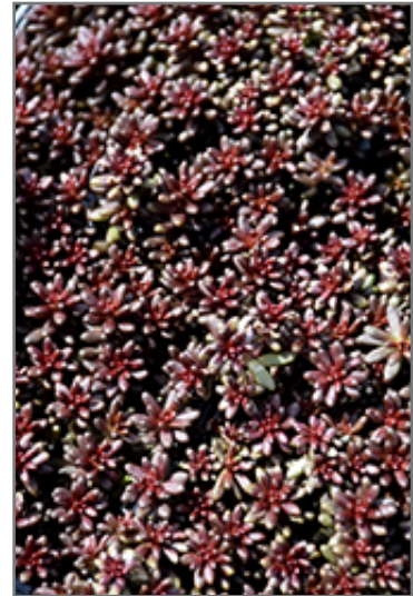
Coral Carpet Stonecrop

This plant is not reliably hardy in our region, and certain restrictions may apply; contact the store for more information.