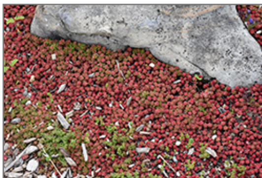
Coral Carpet Stonecrop

Coral Carpet Stonecrop is a dense herbaceous evergreen perennial with a ground-hugging habit of growth. Its medium texture blends into the garden, but can always be balanced by a couple of finer or coarser plants for an effective composition.