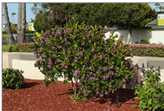
Sweet Pea Shrub in bloom