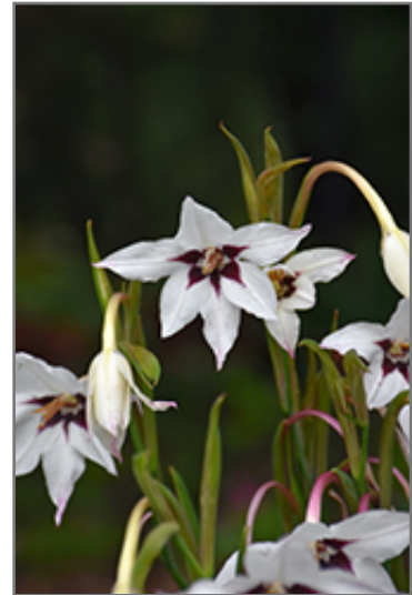
Abyssinian Gladiolus flowers

This is a relatively low maintenance plant, and should be cut back in late fall in preparation for winter. It is a good choice for attracting bees and butterflies to your yard, but is not particularly attractive to deer who tend to leave it alone in favor of tastier treats. It has no significant negative characteristics.