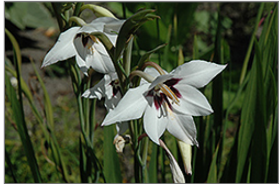
Abyssinian Gladiolus flowers

Abyssinian Gladiolus will grow to be about 24 inches tall at maturity extending to 3 feet tall with the flowers, with a spread of 18 inches. When grown in masses or used as a bedding plant, individual plants should be spaced approximately 6 inches apart. Although it's not a true annual, this fast-growing plant can be expected to behave as an annual in our climate if left outdoors over the winter, usually needing replacement the following year. As such, gardeners should take into consideration that it will perform differently than it would in its native habitat.