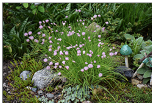
Rising Star Chives in bloom