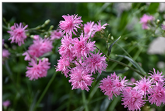
Petite Jenny Ragged Robin Campion flowers

Petite Jenny Ragged Robin Campion is recommended for the following landscape applications;