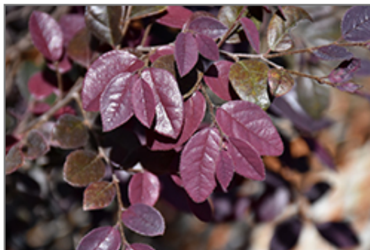
Cerise Charm Fringeflower foliage

Cerise Charm Fringeflower is recommended for the following landscape applications;