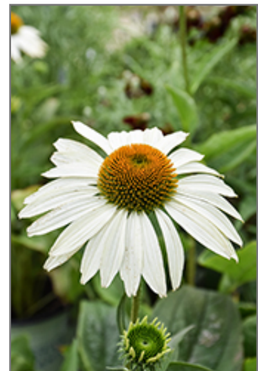
Happy Star Coneflower flowers