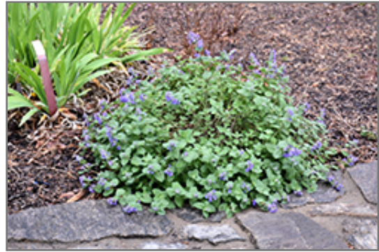
Early Bird Catmint in bloom

Early Bird Catmint will grow to be about 10 inches tall at maturity, with a spread of 12 inches. When grown in masses or used as a bedding plant, individual plants should be spaced approximately 10 inches apart. Its foliage tends to remain low and dense right to the ground. It grows at a fast rate, and under ideal conditions can be expected to live for approximately 10 years. As an herbaceous perennial, this plant will usually die back to the crown each winter, and will regrow from the base each spring. Be careful not to disturb the crown in late winter when it may not be readily seen!