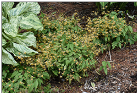
Amber Queen Barrenwort in bloom

This plant is not reliably hardy in our region, and certain restrictions may apply; contact the store for more information.