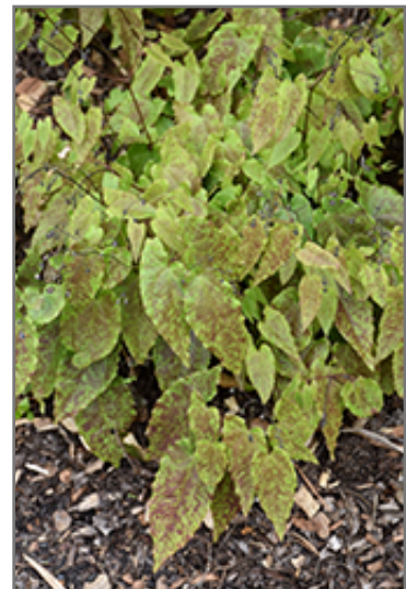
Amber Queen Barrenwort foliage