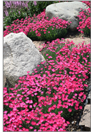
Paint The Town Magenta Pinks in bloom

This plant is not reliably hardy in our region, and certain restrictions may apply; contact the store for more information.