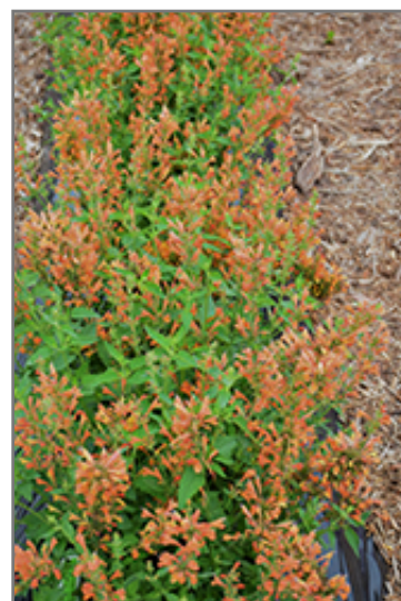
Poquito Orange Hyssop in bloom