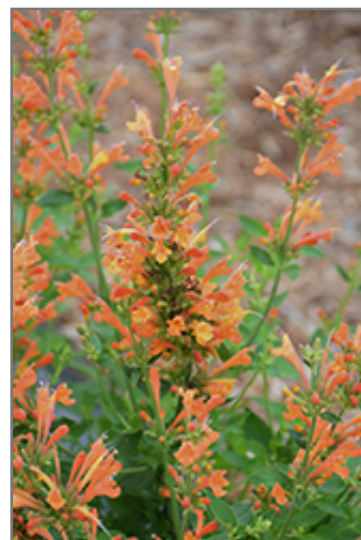
Poquito Orange Hyssop flowers

Poquito Orange Hyssop is a fine choice for the garden, but it is also a good selection for planting in outdoor pots and containers. It is often used as a 'filler' in the 'spiller-thriller-filler' container combination, providing a mass of flowers against which the larger thriller plants stand out. Note that when growing plants in outdoor containers and baskets, they may require more frequent waterings than they would in the yard or garden.