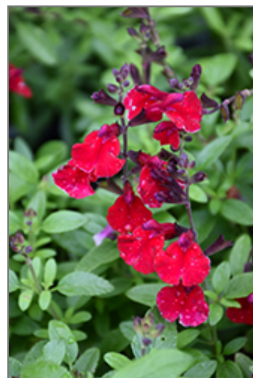
Mirage Cherry Red Autumn Sage flowers